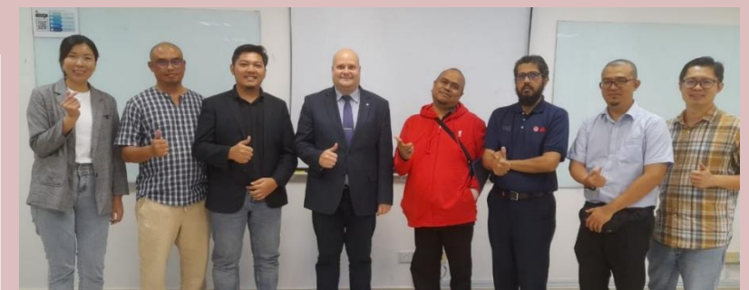
Pioneer batch of IRU DGSA in MALAYSIA - Oct 2024